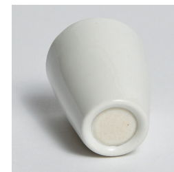
Crucibles include a molded-in porous disc with stable porosity and consistent flow rate.